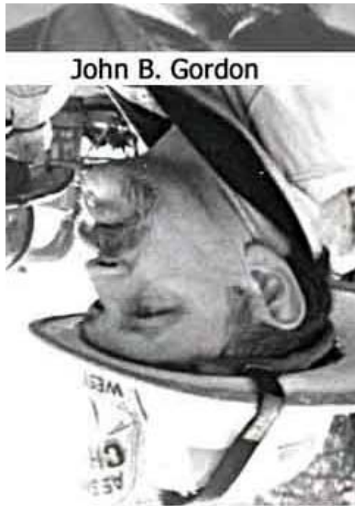
John B. Gordon