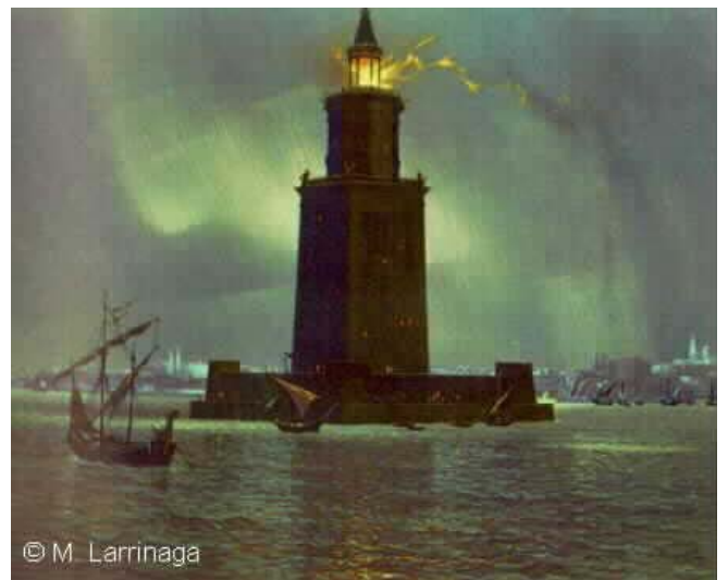
GREAT LIGHTHOUSE, ALEXANDRA, EGYPT - 297BC – PICTURE ON WEB RELEVANT TO 290BC LIFE