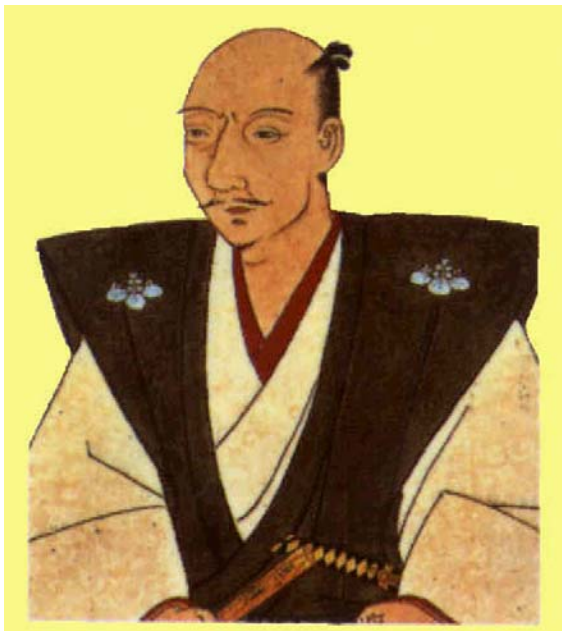
ODA NOBUNAGA – PICTURE FOUND ON WEB OF FATHER IN 1569-1604 LIFE